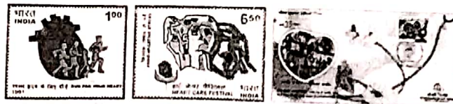
(National Postal Commemorative Stamps)